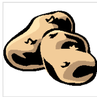
image002.gif (2k) [ View ]